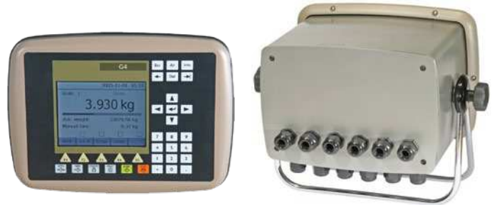
Panel Mount (PM)