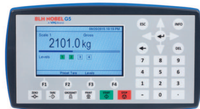
G5 Panel Mount