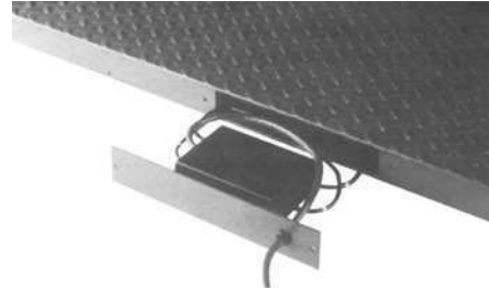
Integral Junction Box